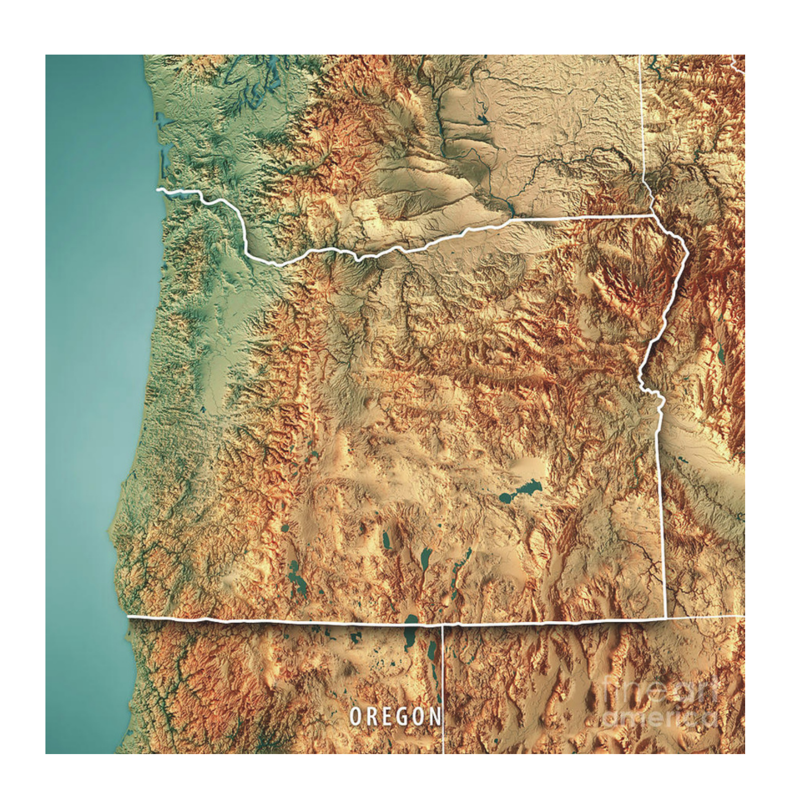
Learn more at www.chinooknation.org.

Trinity Episcopal Cathedral recognizes and honors those who stewarded this land for many generations before us: the Multnomah and Clackamas bands of the Chinook peoples. The Chinook Nation continues to thrive today, and Trinity supports their struggle to achieve federal recognition.